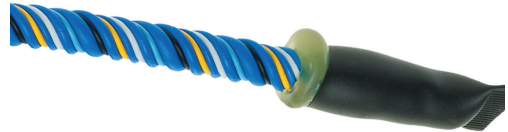
FG-ECS Sense Cable End Termination Tip

2 Communication Wires and 2 Wires for Locating