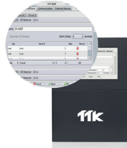
Easy setup of relays for each cable