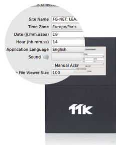
User-friendly interface of configuration