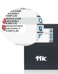
Simultaneous alarms displayed on one screen