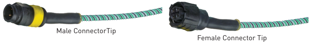
Male Connector Tip